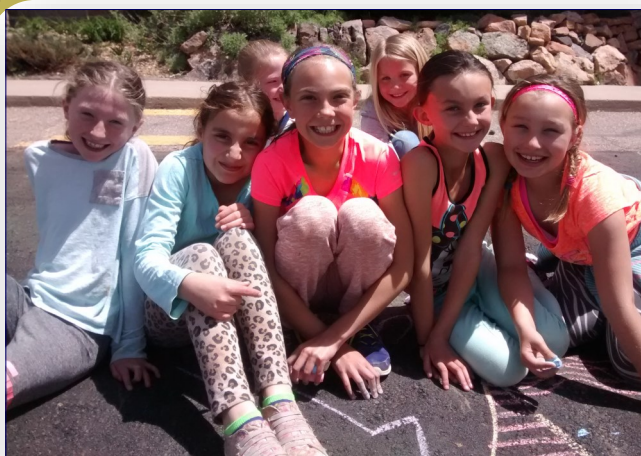
(Pictured above) Third grade students have been enjoying some creativity and camaraderie with sidewalk chalk at recess