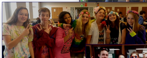
Middle school students took a walk on the silly side for Spirit Week. (Pictured top, right) Feeling Nerdy (Pictured above) Groovin' with the Hippies (Pictured right) Wacky Tourists